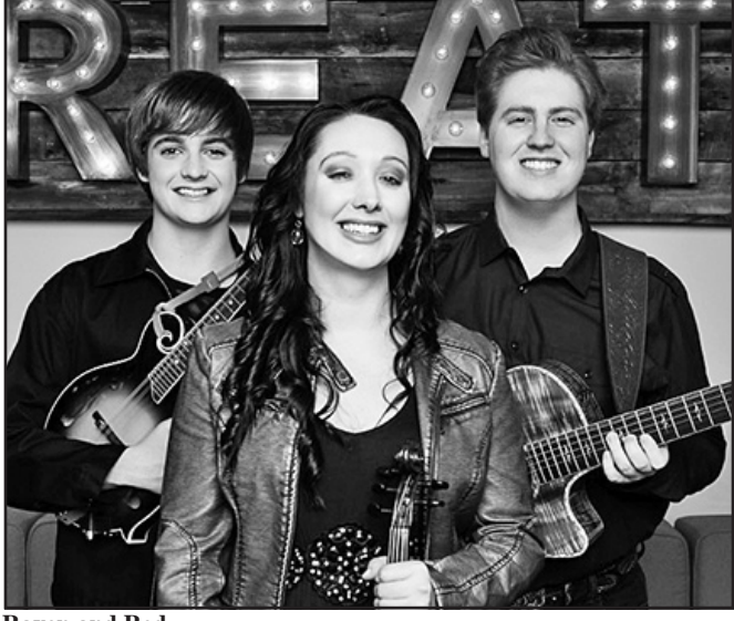
Raven and Red

In 2014, Raven and Red released their debut EP, cals.